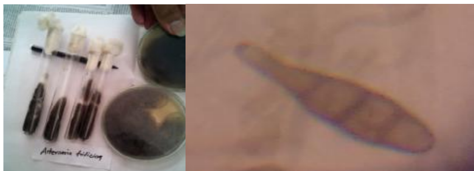
Fig. 1. Cultuer of Alternaria triticina .